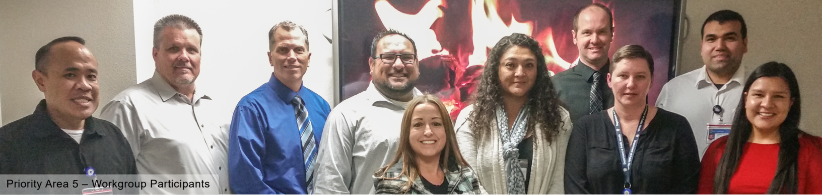
Priority Area 5 – Workgroup Participants